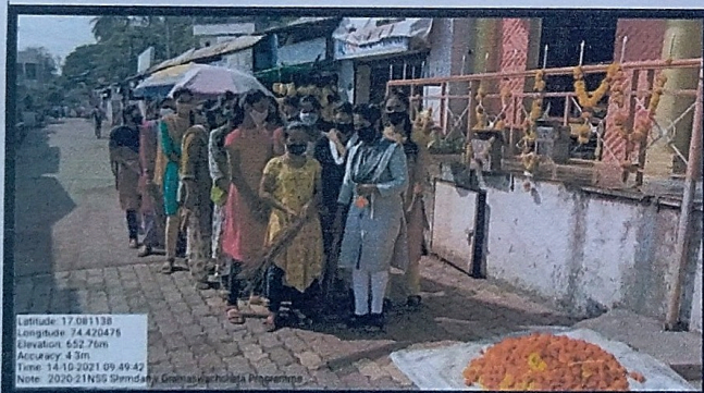
NSS volunteers cleaning areas of ramanandmagar market area.

Students were made aware of importance of cleanliness for goodness of health on the edge of moving to new normals set by COVID Pandemics. A total 65 NSS volunteers participated in cleanliness drive. A belief that a small help in times of need can create huge difference was set in minds of all the presentees. Locals of Ramanandnagar were present during cleanliness drive and appreciated the efforts of NSS volunteers.